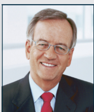
Prof. Dr. Heinrich von Pierer Former CEO and chairman of the supervisory board of the Siemens AG